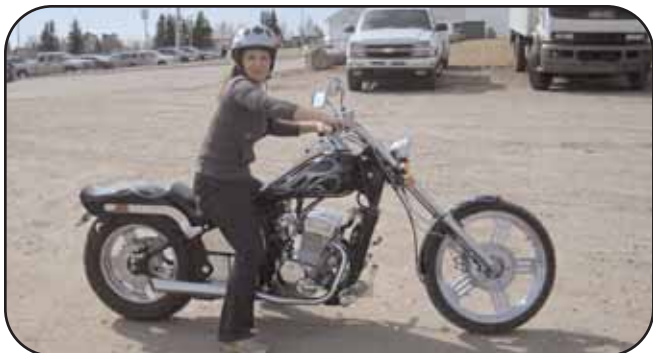
Above & Below: A local lady who hasn't ridden before finds her "Sea legs" on the Johnny Pag

What a hoot! Although I stalled the bike three times before I got used to the feel of the clutch I had an absolute blast riding this machine. The claims of it's handling ability are not exaggerated.