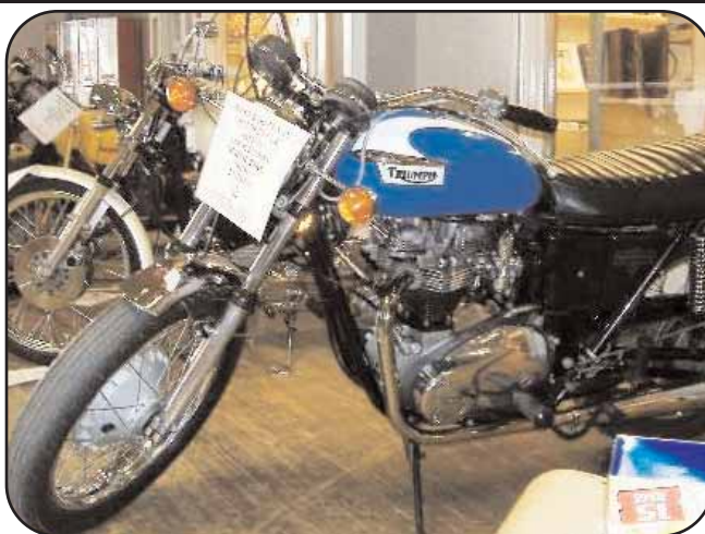
weather than displaying their rides ). My favorite was a vintage bone stock blue Triumph Bonneville.

(I guess everyone would rather be riding in this