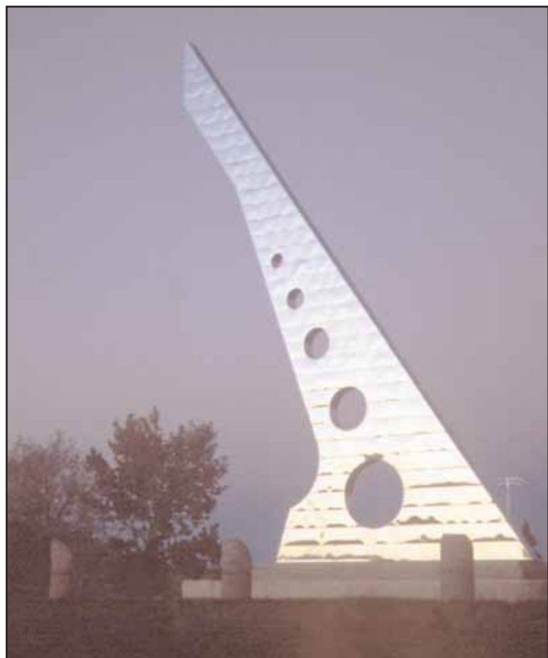
Millennium Sundial & Centre 2000

Make sure that one of your first stops in the City of Grande Prairie is to the regional visitor information centre (Centre 2000) it is a multi-purpose building that houses many organizations and events.